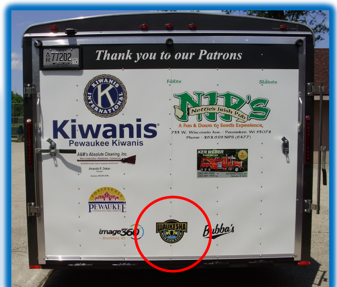
The Pewaukee Fire Auxiliary recognizes the Waukesha Old Car Club for its support