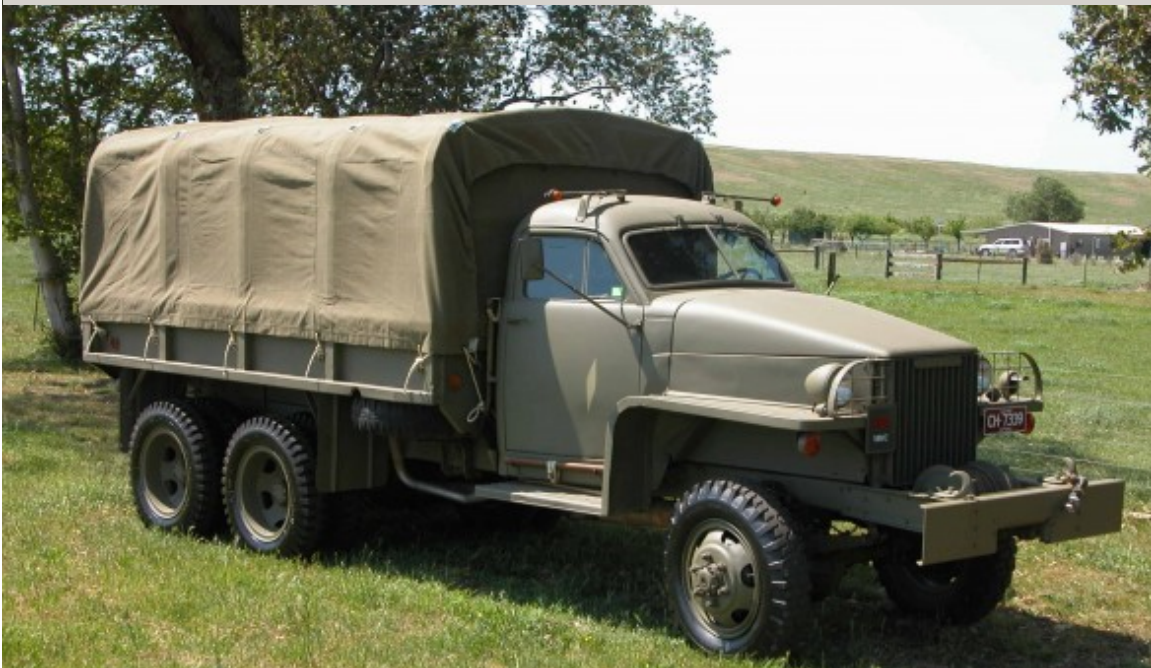
The STUDEBAKER 2 ½ TON TRUCK