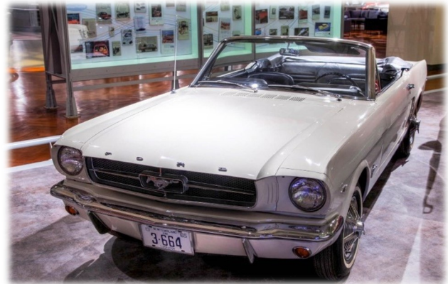
FIRST MUSTANG ON DISPLAY AT THE HENRY FORD MUSEUM

The second Mustang built, a hardtop went to a dealership in the Yukon. It sold at auction for $175,000. Only one other preproduction, 1965 Mustang, is known to have survived.